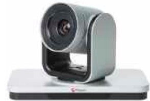
Polycom EagleEye IV 12x Camera (silver)

The Polycom EagleEye Acoustic camera is an optimal solution for a smaller environment. With built-in microphones and small footprint, this camera will easily blend into an executive office or huddle room.