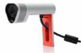
Polycom EagleEye Acoustic Camera