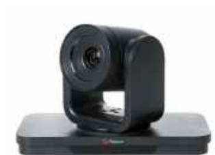
Polycom EagleEye IV 4x Camera (black)